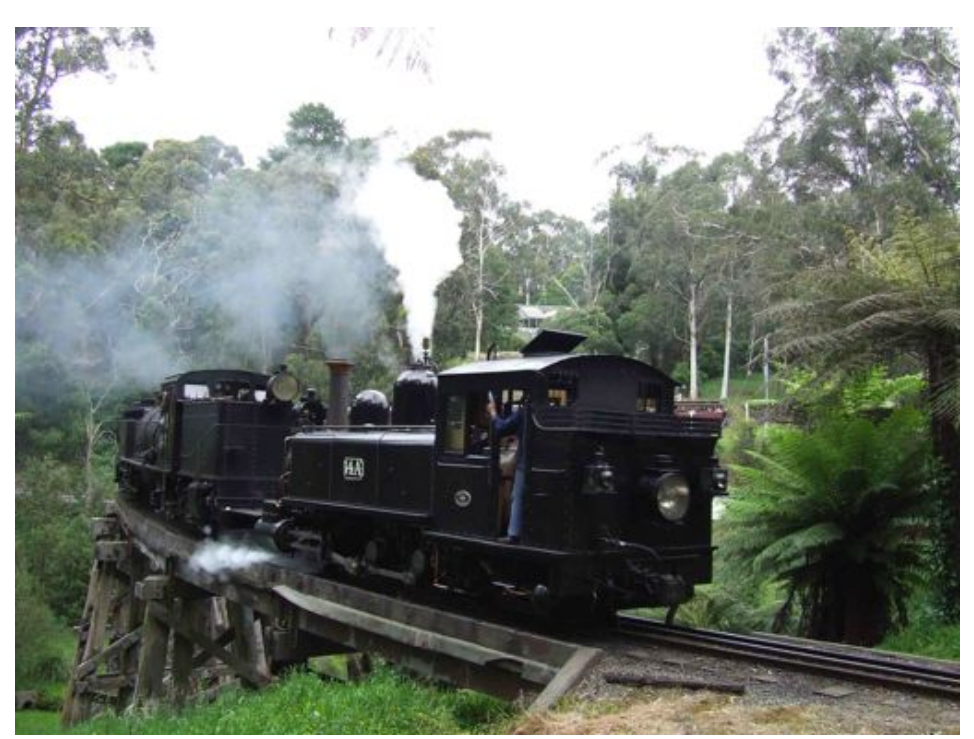
Puffing Billy, one of the most popular steam railroads in the world runs along the foothills of the Dandenong Range to Gembrook near Melbourne. It has several 2-6-2T engines for normal use and a few diesel engines to use when fire danger is high.