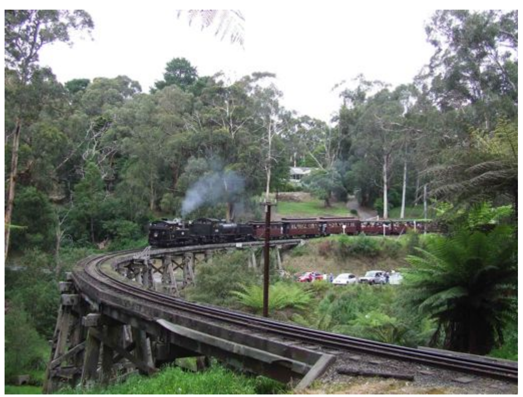
Puffing Billy opened in 1900, a single track, 15.6 mile system with eleven stations. It offers 3 to 6 trips / day except on Christmas on 30 inch gauge track.