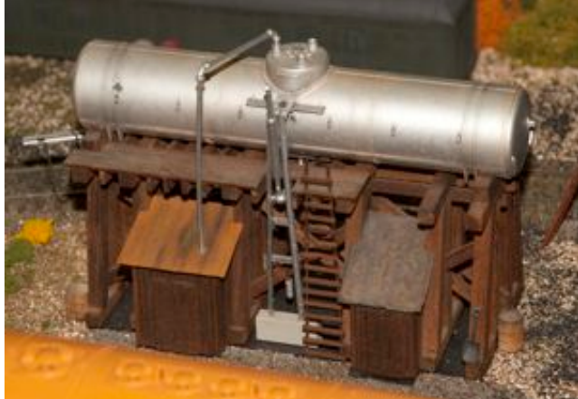
Above, a diesel fueling station built from kit and scratch materials.

The above article will be continued next month