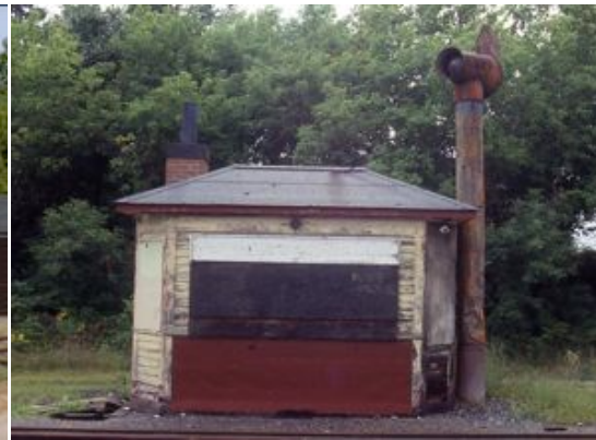
August 1997 in the WC Yard

We have the restored scale house on site at Rhinelanders' Pioneer Park. We can measure it, photograph it and build models of it.