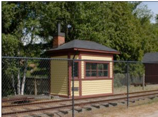
June 2006 at the Park

Here are two of my photos of the very same Rhinelanders Yard Scale house. More photos are on the TLMRC site.