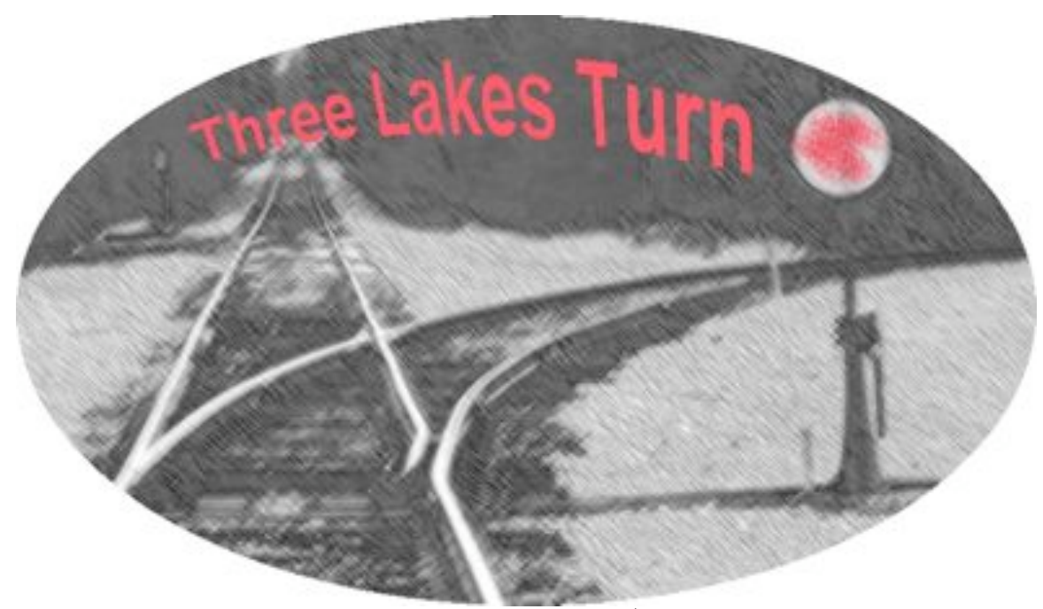
Three Lakes Model Railroad Club Volume 2, Number 5